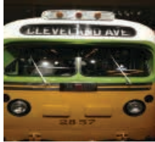
Rosa Parks' historic moment